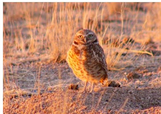
Adult Burrowing Owl on its breeding grounds at Kirtland Air Force Base, NM.

DoD manages nearly 30 million acres of land, water, and air resources across hundreds of installations; the Army Corps of Engineers manages an additional 12 million acres. These lands represent a critical network of habitats for birds, offering migratory stopover sites for resting and feeding, as well as suitable sites for nesting and rearing their young. The many installations that provide these important habitats form DoD's Steppingstones of Migration . DoD PIF is committed to ensuring that these areas, along with the species that depend on them, are protected and sustained for future generations.