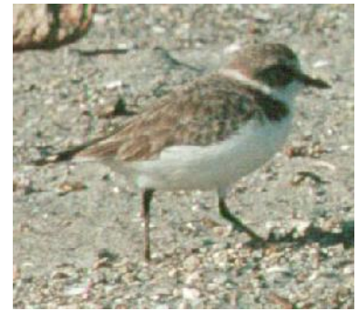
Western Snowy Plovers breed and winter on military lands in coastal California.

Any military installation or Army Corps of Engineers project is eligible to be nominated as an IBA if it potentially meets IBA criteria. Once a site is nominated, the appropriate organization reviews the nomination. If it meets the criteria, the site is identified as an IBA. Once a site has been identified, official recognition as an IBA via a ceremony or other public outreach method may take place at the discretion of the installation. A Memorandum of Understanding with American Bird Conservancy and National Audubon Society outlines the expected procedures to be followed for the IBA process on DoD lands. DoD sites recognized as IBAs may receive a certificate and sign.