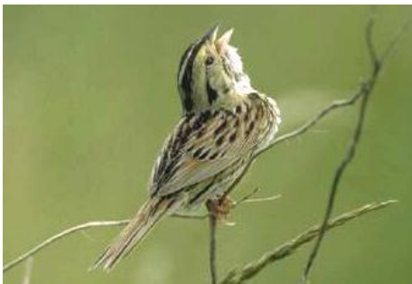
Henslow's Sparrow, a Watch List species, thrives on U.S. military installations.

Ultimately, by identifying high quality habitats and recognizing them as being important for birds, the IBA Program seeks to mobilize the resources needed to protect these areas by raising public awareness of their significance. With over 71 million Americans who watch and/or feed birds, the public is a powerful constituency for bird conservation. An important distinction should also be made that an IBA is not necessarily an important birding area. An IBA exists for birds, not for bird watchers. IBAs can include Watchable Wildlife opportunities, but only if such