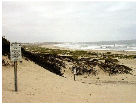
Vandenberg Air Force Base provides undisturbed beaches for nesting, wintering, and migrating shorebirds and waterbirds.

opportunities do not compromise the military mission or continued conservation actions. On military lands, IBAs can be an effective tool to engage adjoining landowners in landscape level conservation planning. Sometimes, it is the training mission itself that creates and sustains quality habitat. IBA recognition is thus an important tool to educate the public that while DoD lands are managed to support the military's training mission, they also provide significant habitat for the conservation of natural resources, including birds. When a conservation plan is desired for a network of IBAs, INRMPs and Corps comprehensive management plans already provide the necessary information; no additional management planning is required.