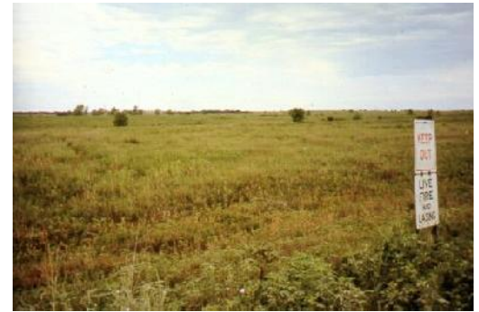
Fort Riley's (KS) 50,000 acres of native tallgrass prairie is the largest remaining contiguous habitat of this type in North America.

same year in partnership with ABC, and has been building programs state by state. As of 2004, Audubon was operating IBA programs in 46 states. Today, ABC continues its IBA program for sites of global significance, but Audubon is now the BirdLife partner designate in the U.S., and is expanding its IBA program to include sites of global and continental significance.