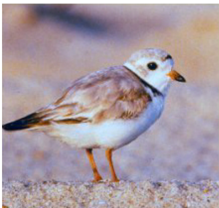
Priority species with low populations, like the Piping Plover, are more threatened by WNV.

While birds are the primary carriers of this disease, WNV has also affected a number of mammal species, such as horses, squirrels, chipmunks, bats, skunks, rabbits, mountain goats, seals – and humans. Infection with WNV is not fatal for all birds, but certain groups are apparently more susceptible than others, including corvids (crows & jays) and raptors (hawks, owls, eagles & vultures). Over 140 different species of birds are known to be affected by WNV as of spring 2003. Exotic and captive species, such as those found in zoo collections, are affected as well as wild ones.