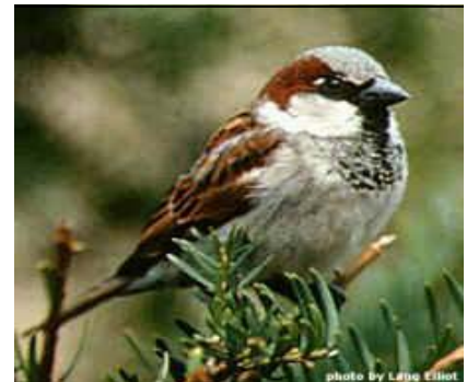
The House Sparrow is a key species in the propagation of WNV to other species.

Residents or military personnel at installations should contact the Pest Control Coordinator, the Base Medical Clinic, or the natural resources staff. If none of these exist at the installation, contact your state or local health department for their policy on the reporting or collection of dead birds. See the CDC web site link above for state and local contact information.