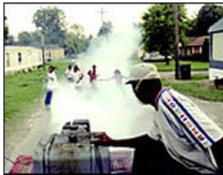
Although West Nile Virus can pose a threat to human health, wide-spread spraying of pesticides can be a greater health hazard.