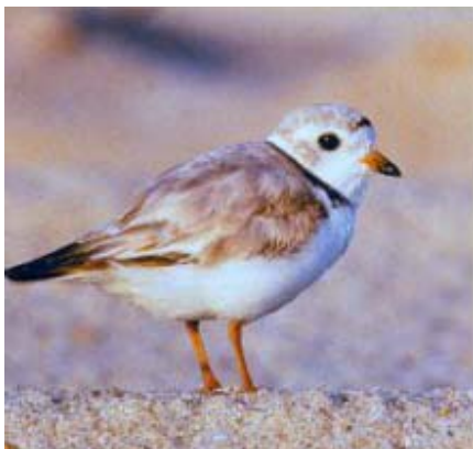
Priority species with low populations, like the Piping Plover, are more threatened by WNV.

While birds are the primary carriers of this disease, WNV has also affected a number of mammal species, such as horses, squirrels, chipmunks, bats, skunks, rabbits, mountain goats, seals – and humans. Infection with WNV is not fatal for all birds, but certain groups are apparently more susceptible than others, including corvids (crows & jays) and raptors (hawks, owls, eagles & vultures). Over 140 different species of birds are known to be affected by WNV as of spring 2003. Exotic and captive species, such as those found in zoo collections, are affected as well as wild ones.