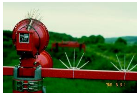
An anti-perch device can help reduce the attractiveness of an airfield to raptors.

Due to continued human population growth and urban development around the country, large, grassy areas on airports and adjacent lands are fast becoming islands of preferred bird habitat; however, reducing the risk of bird strikes and managing for bird species do not have to be mutually exclusive. An effective BASH prevention program is vital for safe air operations, and in some areas can facilitate priority conservation objectives.