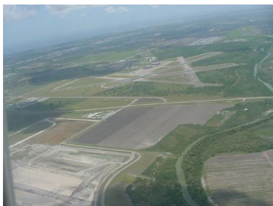
Land uses surrounding an airfield can attract birds and other wildlife species, potentially increasing the risk for a damaging strike.

In an effort to manage habitats and wildlife species, all military installations are required to develop an Integrated Natural Resources Management Plan (INRMP). The BASH Plan is an integral part of the INRMP. It is a fine line for the natural resource manager when managing