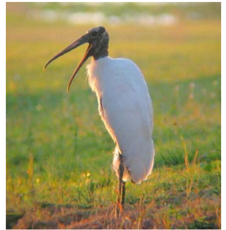
The Wood Stork is a High Concern in the Waterbird Plan, as well as being Federally Endangered.

This FWS list identifies species whose population are below long-term averages or management goals, or for which there is evidence of declining population trends. The list refers to waterfowl and migratory shore and upland game birds of management concern, and are a subset of the list of all species (50 CFR 10.13) protected by the Migratory Bird Treaty Act.