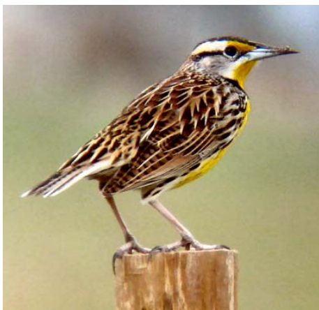
Eastern Meadowlark, a PIF species of High Regional Priority.

Scores were assigned to the 448 breeding landbird species occurring regularly in Canada and the U.S. in six biologically based "global" categories (vulnerability factors) including: Relative Abundance, Breeding and Non-breeding Distributions, Threats to Breeding and Non-breeding (Conditions), and Population Trend. A seventh factor, Area Importance (AI),