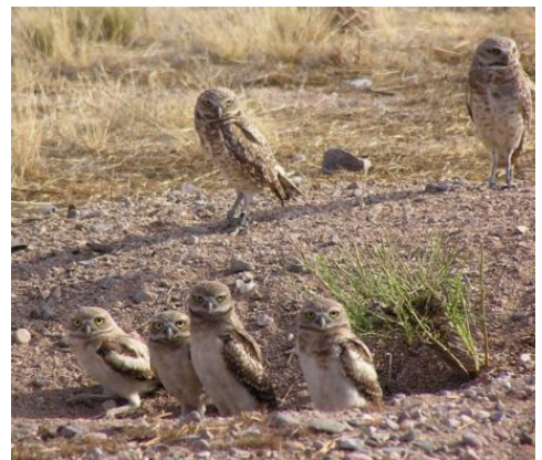
Burrowing Owl is a national species of concern, and a priority for the DoD PIF Program.

to the printing of the Strategic Plan. An annual planning workshop of the DoD PIF Representatives provides guidance to Fact Sheet development and ongoing bird conservation priorities for DoD.