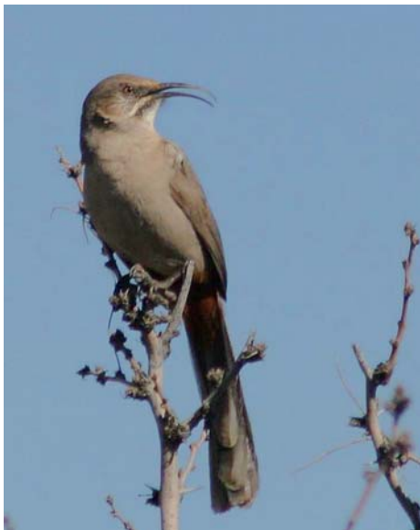
Crissal Thrasher, a PIF Species of Continental Importance in the Southwest Avifaunal Biome.

The Legacy Resource Management Program 2006 Technical Notes featured the DoD PIF program as a significant Legacy-funded project. One of the major contributions of DoD PIF to the Legacy program is the review process to evaluate all pre-proposal and full proposal submissions to the annual Legacy funding cycle. The network of DoD PIF Reps reviewed an average of 24 bird-related pre-proposals to see if each one meets required criteria to warrant a full proposal submission. An average of 13 full proposals each year were then reviewed in detail and scored in each of 10 criteria developed by the DoD PIF Program. The sum of these scores was presented as a