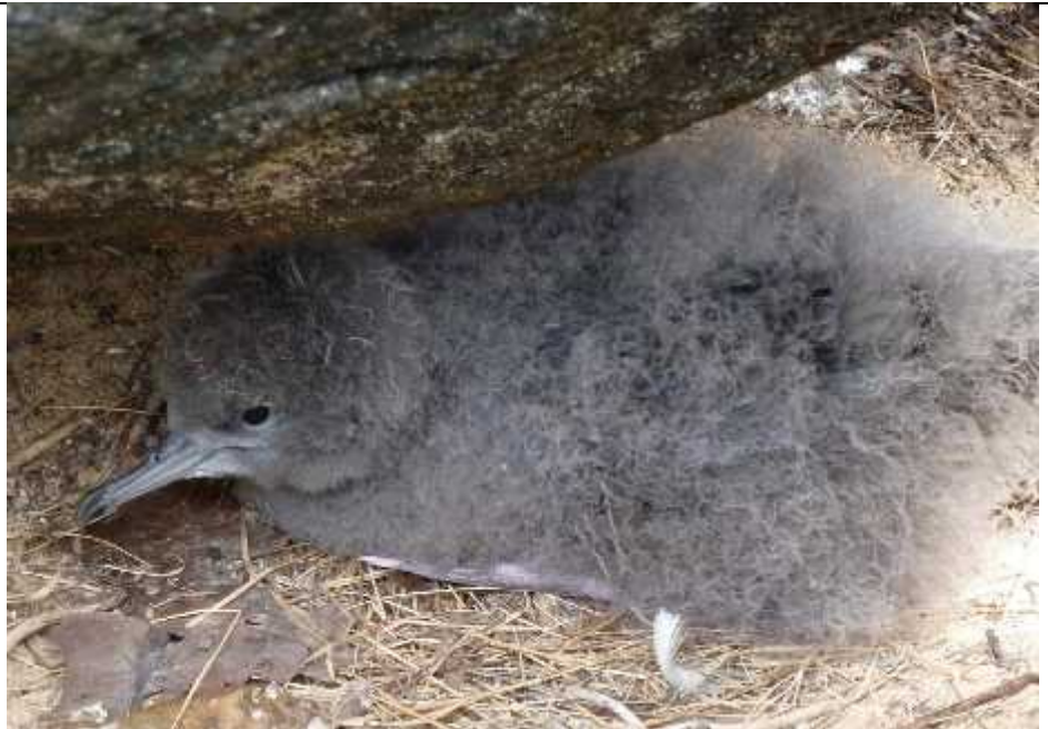
Wedge-tailed Shearwater is one of many species benefitting from active management, including removal of introduced predators, on DoD lands in Hawaii.

One of the major contributions of DoD PIF to the Legacy Program is the review process to evaluate all pre-proposal and full proposal submissions to the annual Legacy funding cycle. The network of DoD PIF Reps reviewed 30 bird-related pre-proposals for the 2011 Legacy funding cycle to see if each one meets required criteria to warrant a full proposal submission. Of these, 23 full proposals were then requested and reviewed in detail and scored in each of 10 criteria developed by the DoD PIF Program. Due