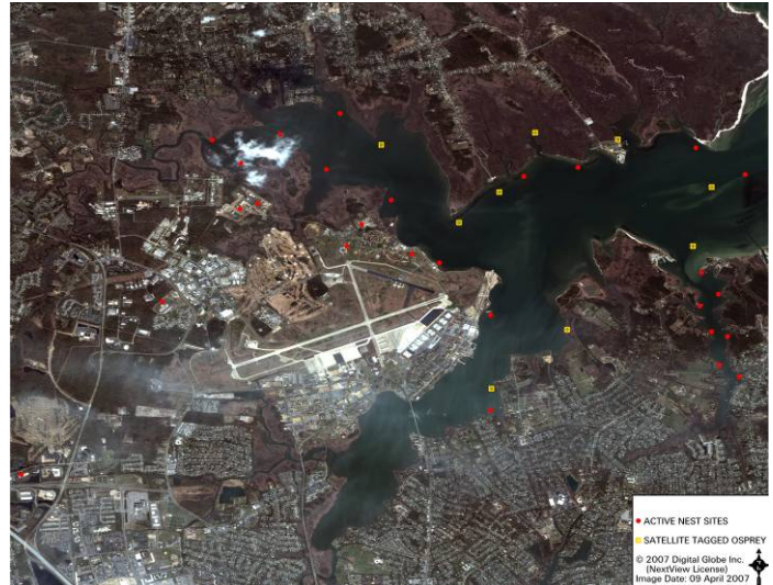
Map of Osprey nests surrounding Langley AFB, Virginia.

All birds were marked with leg bands and 14 Osprey were fitted with GPS-capable satellite telemetry packages. We captured more females than males. Female Osprey were likely easier to capture due to their intrinsic parental behavior to incubate eggs or brood nestlings. Males were more reluctant to approach nest traps, often observing and defending nests from a nearby perch. Two males were caught using nest traps baited with fish. Inexperienced first or second year breeding Osprey might be easier to catch than older more experienced adults.