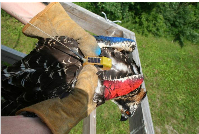
Fledgling Osprey 51 fitted with 30gr GPS/PTT 100.

The project team captured and marked a total of 20 adult (11 female and 5 male) and 4 nestling Osprey during 2006 and 2007, including 3 breeding pairs. All captures occurred at artificial nesting substrates. Capture times ranged from 3 to 37 minutes. Caption Here