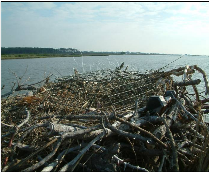
Nest trap used to live-capture Osprey nesting on duck blinds in Back River of the Chesapeake Bay, Virginia

Raptor trapping methods used included: (1) nest trap, (2) dho-gaza trap, (3) padded pole trap, and (4) hand-capture. Application of each method was dependent upon the nest size, accessibility, and age or sex of the targeted Osprey. All traps were consistently monitored and evaluated for efficiency.