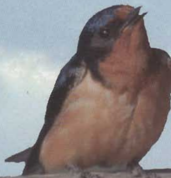
Barn Swallow