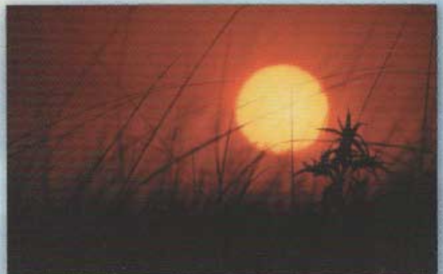
Jamaica Bay National Wildlife Refuge, NY